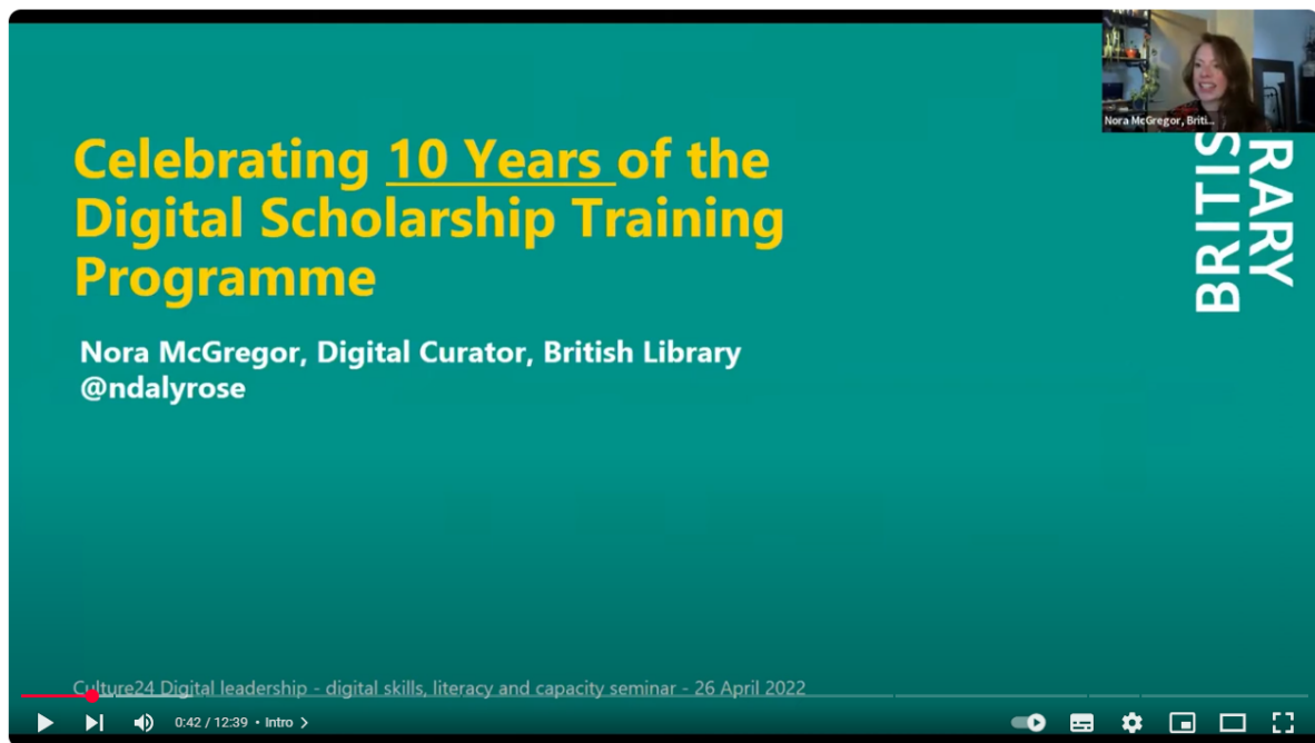
Figure 2: Watch the video

In this short video from a Culture24 Digital Leaders - digital skills, literacy and capacity online seminar, I talk about inspiring and supporting team members from The British Library to pursue digital skills and literacy development through their Digital Scholarship Staff Training Programme.